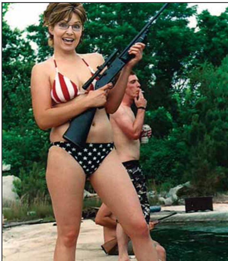
Former Governor Sarah Palin mugs for camera