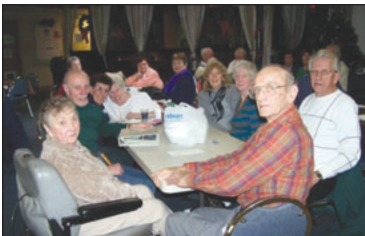
It's door prize time.